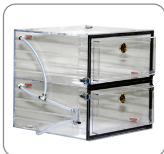
800-FLOW/D Desiccator Flow Meter Kit