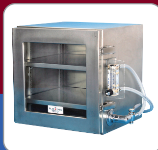
Stainless Steel Desiccators