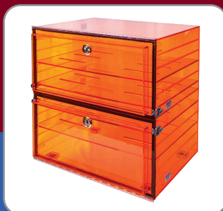
Amber Acrylic Desiccators for light sensitive materials