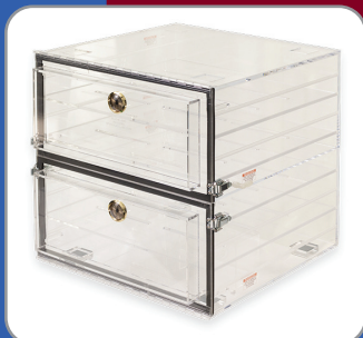
Clear Acrylic Desiccators