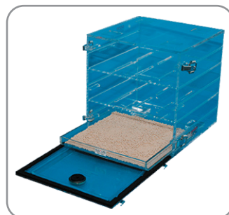
860-TRAY Desiccant Tray only