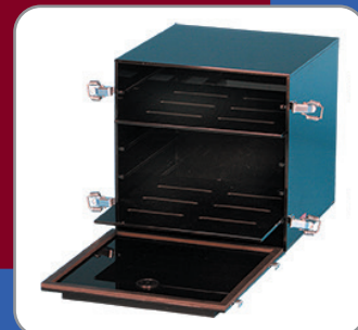
Black Acrylic Desiccators