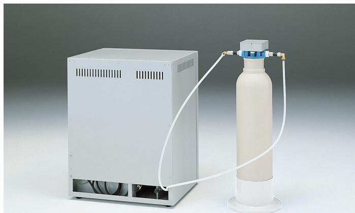
Connection unit G (WL100+WG250)