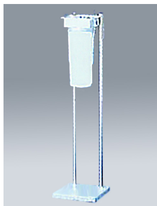
Filter stand + Filter housing unit